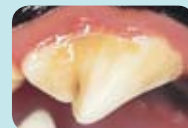
Unhealthy mouth with gingivitis and calculus