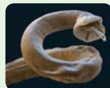
Adult A. vasorum lungworm These live in the heart and pulmonary arteries

Lungworm infestation, caused by the parasite Angiostrongylus vasorum is something that all dog owners should be aware of. Angiostrongylus vasorum can cause a wide range of symptoms – some severe, including coughing, lethargy, fits and blood clotting problems. However other pets may show no obvious signs of problems.