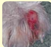
Paw of a dog with an interdigital cyst caused by a grass seed