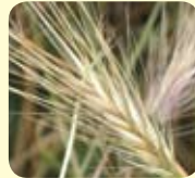
Grass awns of the summer grasses